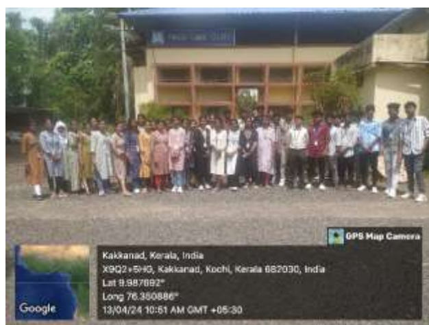
Industry Visit by Faculty with Students to Traco Cables Co Ltd, Cochin, Kerala