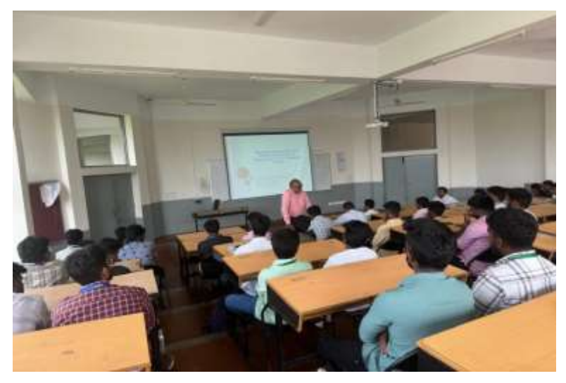
Inaugural Ceremony of IEEE Geoscience and Remote Sensing Society