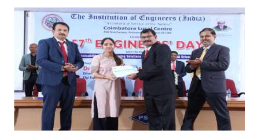
Best student Award - IEI, Coimbatore