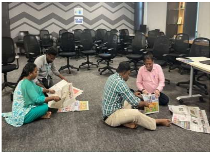
Guest Lecture on "Entreprenuership in Civil Engineering"