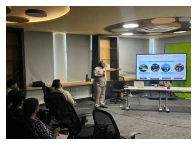
Expert Talk on "Experimental Studies on Special Concrete"