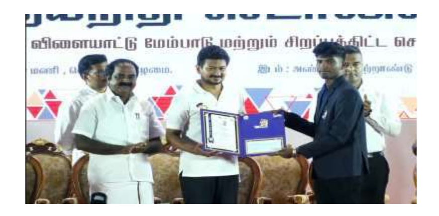
Medallion of Excellence- India Skills 2024