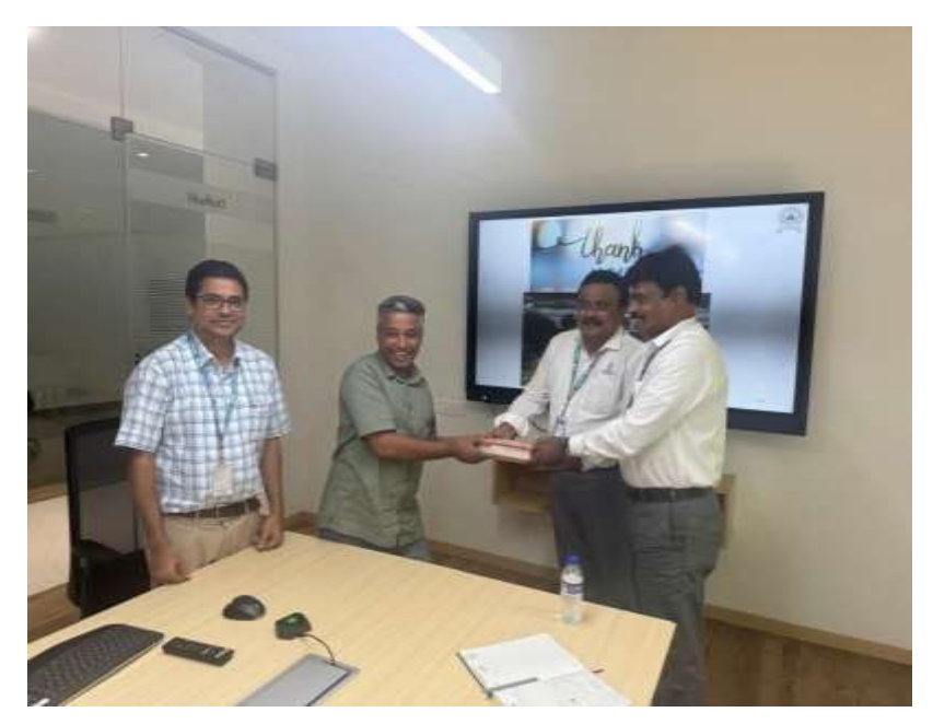
Expert Talk on "Competencies of Quantity Surveying"