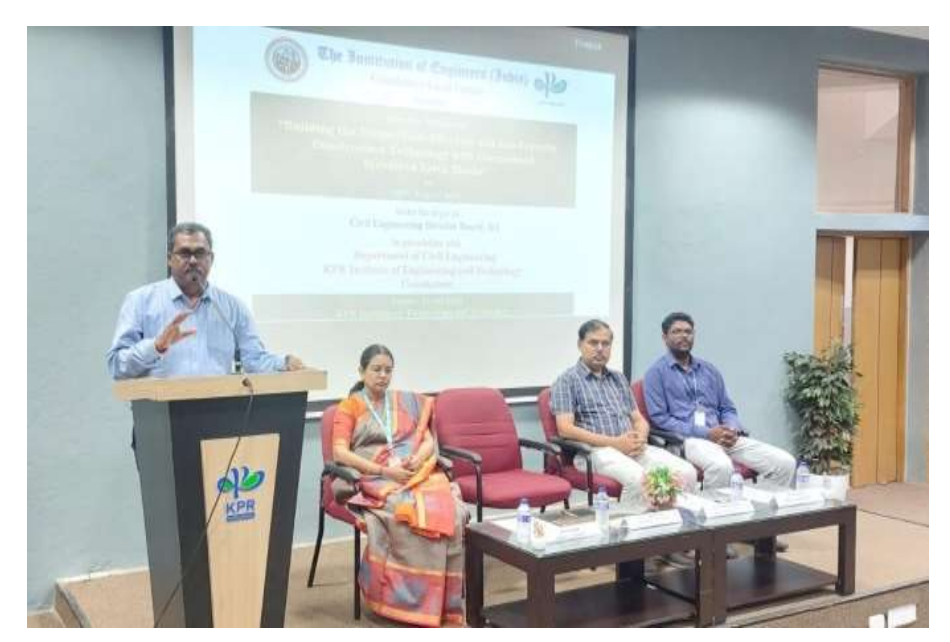
Expert Talk on "Competencies of Quantity Surveying"