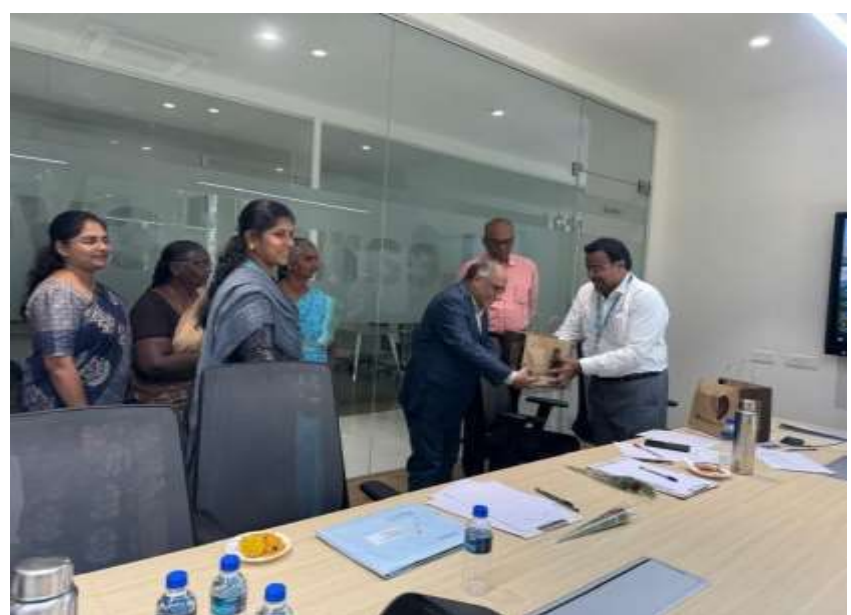
Expert Talk on "Water Resources Engineering and Management"