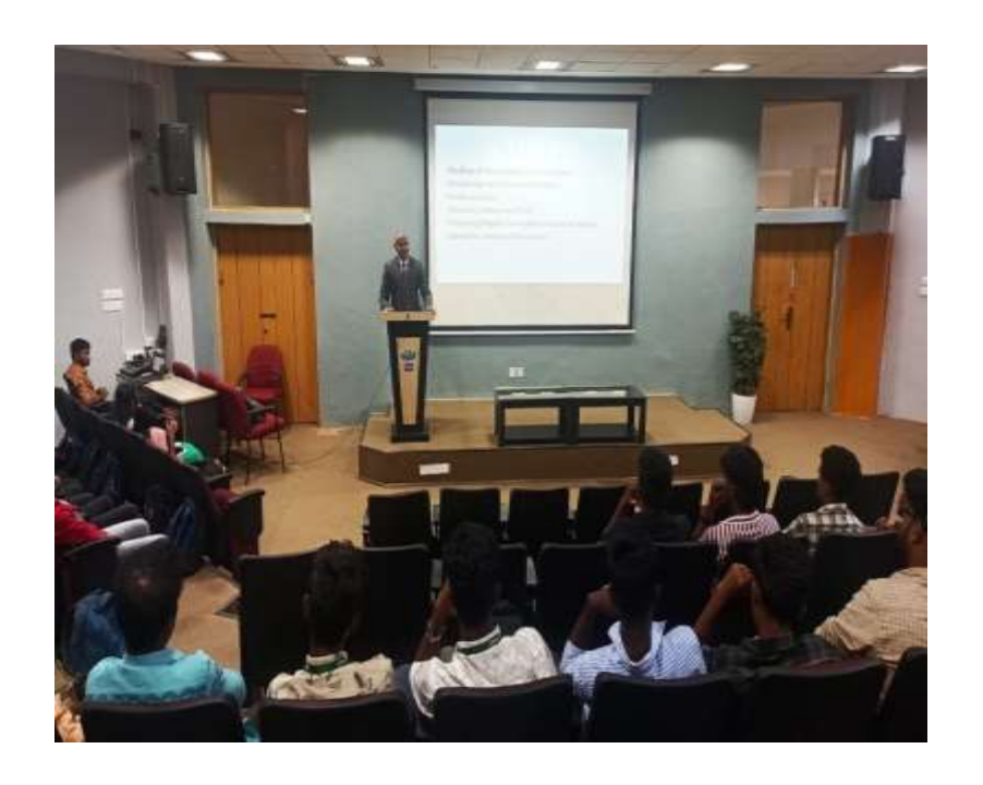
Civil Engineering Students' Association Inaugration

Dubai. The event aimed to provide a comprehensive understanding of the essential skills and competencies required in the field of Quantity Surveying. It was designed specifically for civil engineering students, offering insights into current industry practices, emerging trends, and the evolving role of quantity surveyors in the construction industry.