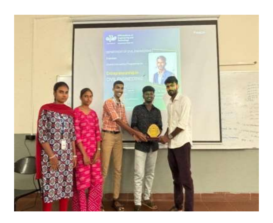
Expert Talk on "Removal and Utilization of Heavy Metals in Wastewater"

backgrounds, fostering networking and mentorship. It provided valuable insights into the career world, helping students develop relationships with alumni who can offer guidance and support as they navigate their career paths.