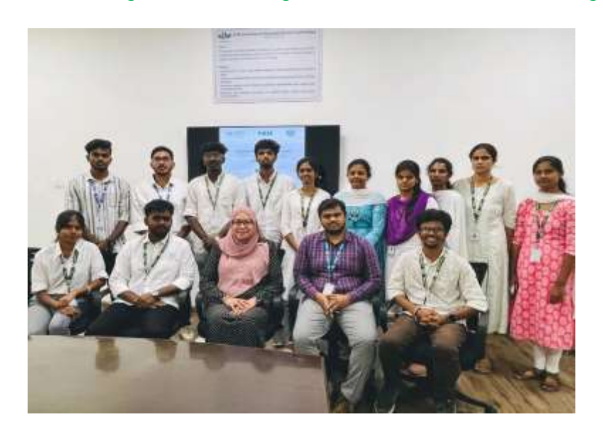
Seminar on "Research on Commercialization"

research, innovative technologies, and practical applications that sparked engaging discussions among attendees. This event has set a dynamic tone for the upcoming year, underscoring the society's dedication to advancing excellence in geoscience and remote sensing.