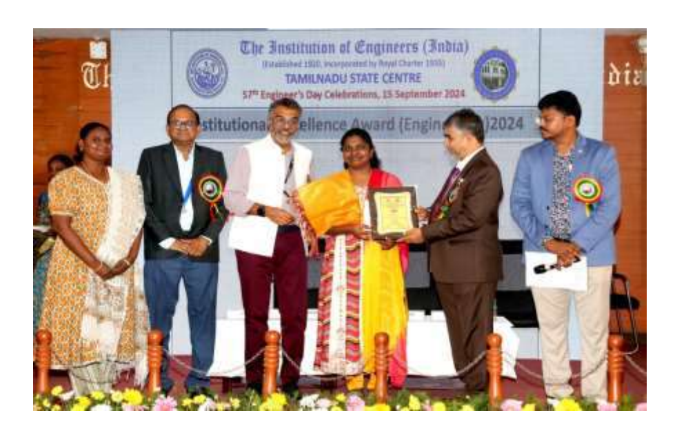
Institutional Excellence Award from IEI