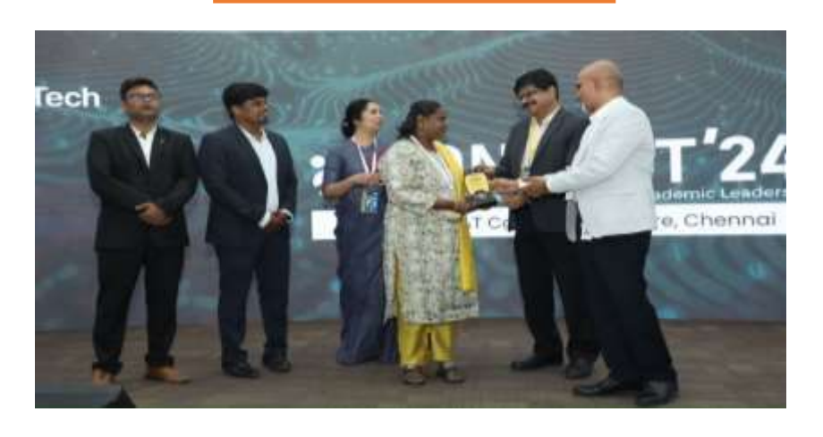
L&T Edutech SPOC Recognition