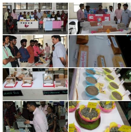
Construction Materials Expo on 14.09.2019