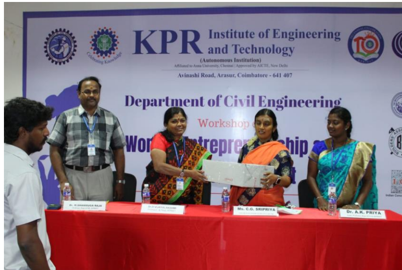
Honouring the Chief Guest at Women Entrepreneurship and Skill Development on 07.09.2019