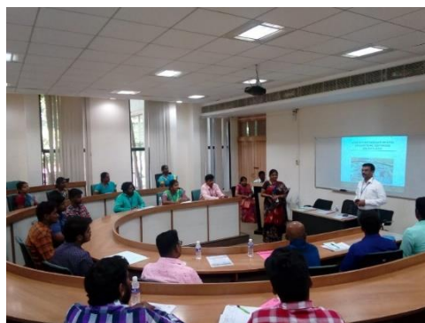
Executive Development Programme