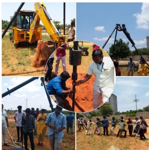
SPT Demonstration on 14.09.2019