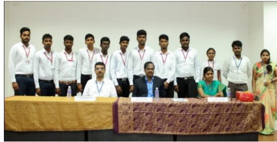
Civil Engineering Association Inauguration on 14.08.2019