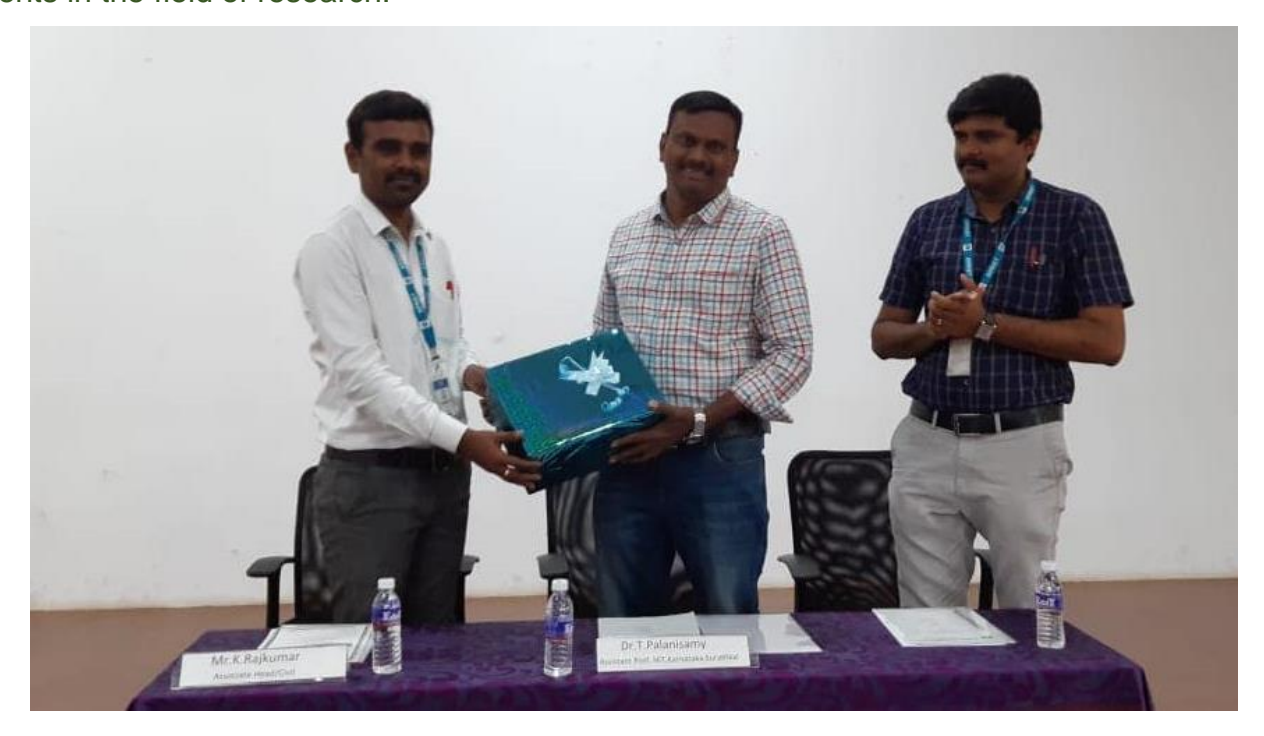
Guest Lecture on "Artificial - Aggregates for Sustainable Development"

development in Concrete industry. At the end of session, he discussed about the opportunities to students in the field of research.