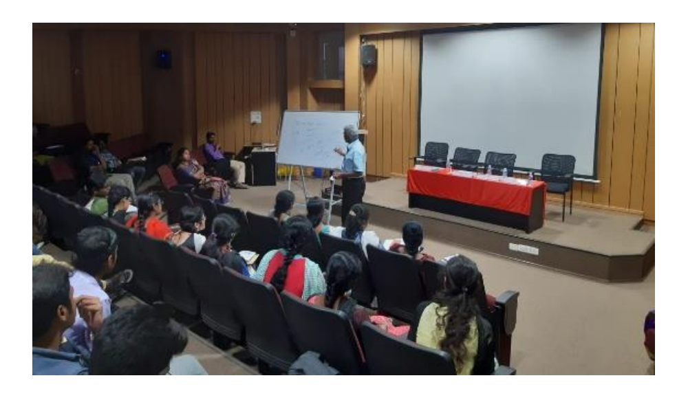
Expert lecture on Engineering for Change: Expectations & Challenges

Member Executive Management Council, CRI group Coimbatore explained his ideas of how a change has to be or how a change maker has to be. He discussed on a lot of topics which included changes in the society as well as in the field of engineering. He also explained about 5 why's that anybody has to ask oneself before doing something and he gave a short note on difference between continual and continuous change.