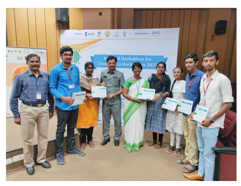
III-year students got selected to participate Hackathon in Institute level (KPRIET)