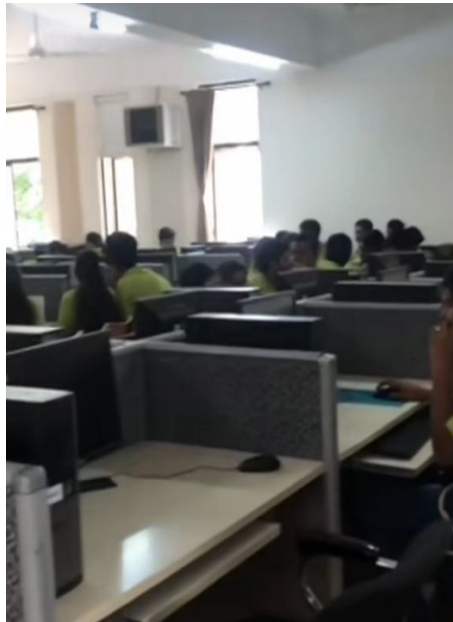
Click to View