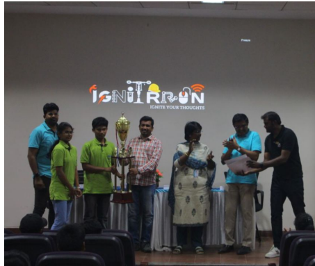
Click to View