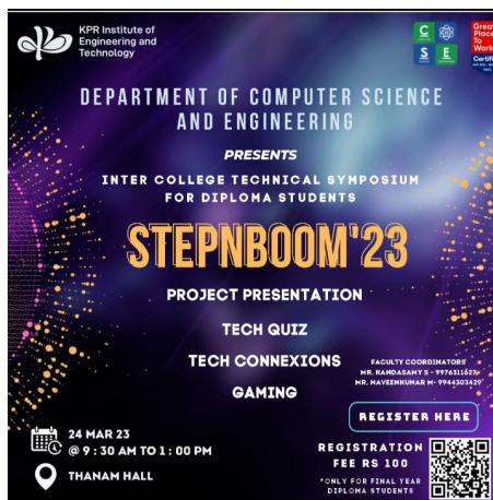
Click to View